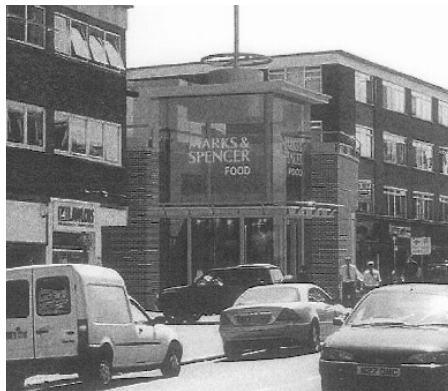
An impression of how the new M&S store will look

Willingale Road Allotments – having agreed in principle to the transfer of the allotments to LTC, EFDC are still placing difficulties in the way of completing the handover of responsibility. We'll keep you informed of progress.