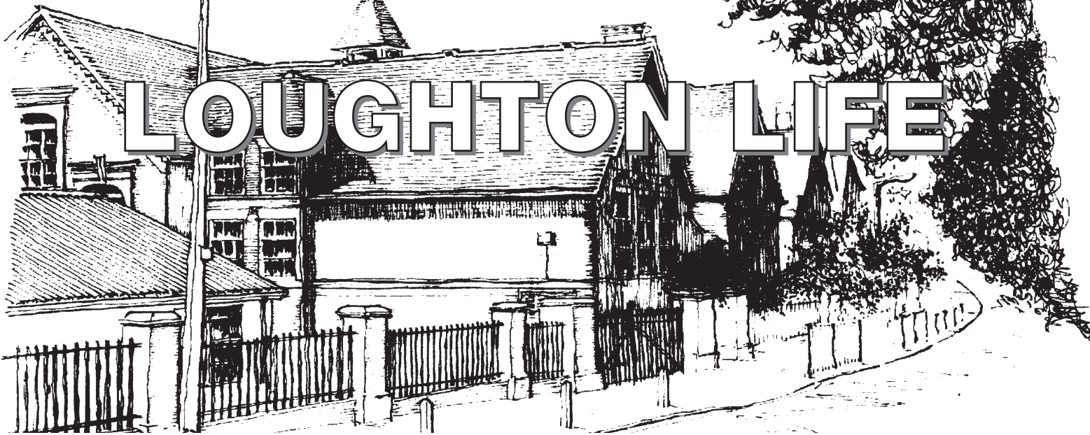
Staples Road School drawn by Ron Heath