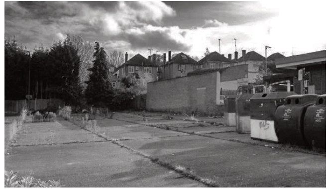
Church Hill car park