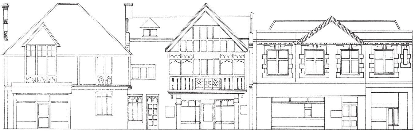
Loughton High Road, by Ron Heath.